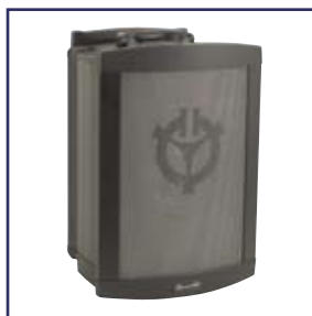
● Challenger 1004 UHF (120W)