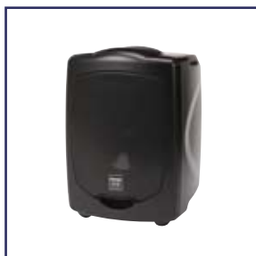
● Focus 505 UHF (30W)