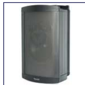
● Victory 2004 UHF (120W)

Our portable PA systems are available with a full range of microphone/transmitter options including handheld, tieclip, collar and head worn.