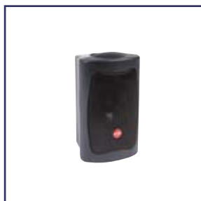
● Smart 300 VHF (25W)