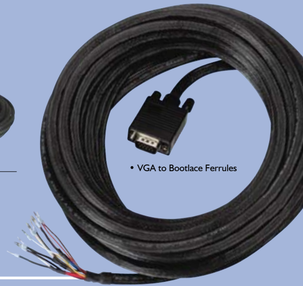
• VGA to Bootlace Ferrules