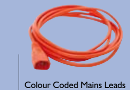
Colour Coded Mains Leads