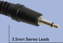
3.5mm Stereo Leads