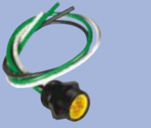
Panel Mount Waterproof