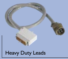
Heavy Duty Leads