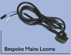
Bespoke Mains Looms