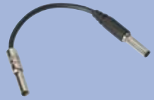
High Quality Moulded Leads