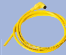
Conxall Sensorlink Cables