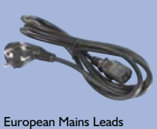
European Mains Leads