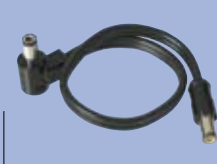
Moulded DC Power Leads