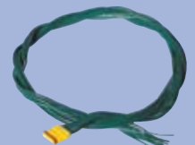
Automotive IP-Rated Cables