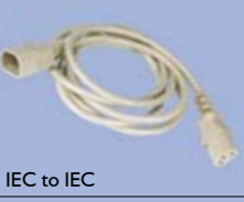
IEC to IEC