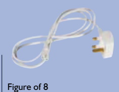
Figure of 8