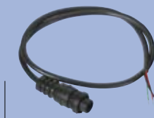
Switchcraft EN3 Cables